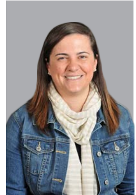
Director of Networks & Communities