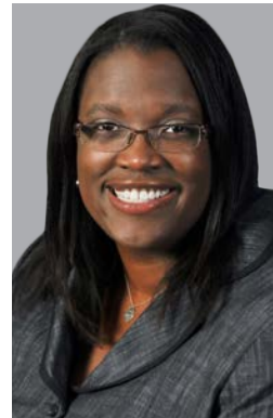
District Deputy Director