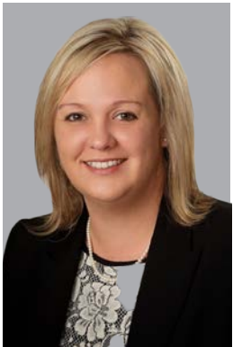
Director of Adult Education Communities