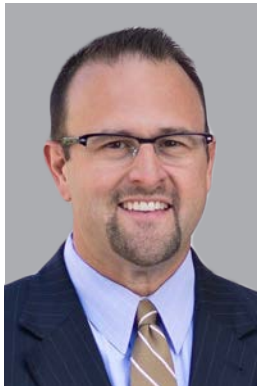
Director of Economic Development