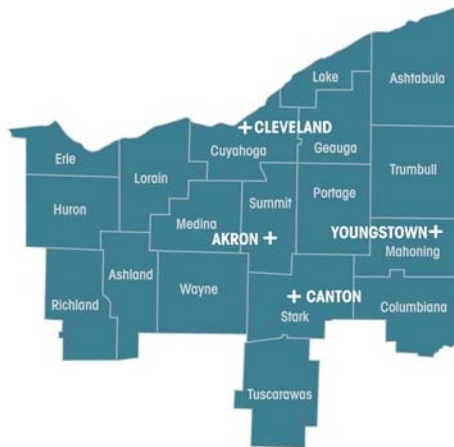
18 County Cleveland Plus Region