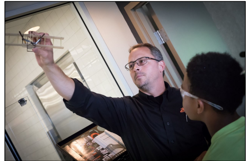
Bastech Additive Manufacturing & 3D printing