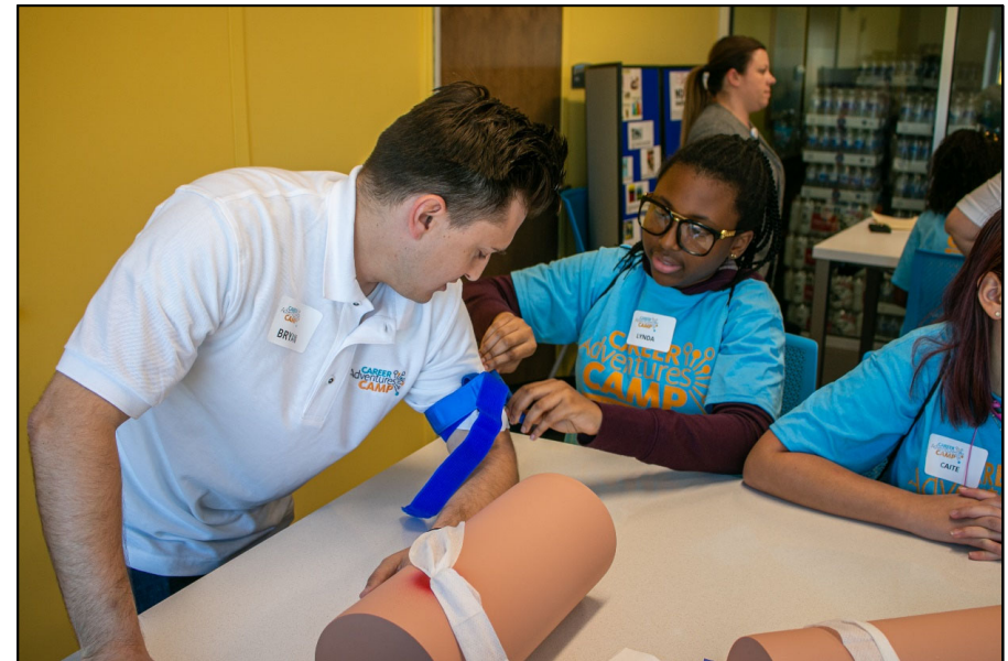
Practicing tourniquets and wound care at Dayton Children's Hospital