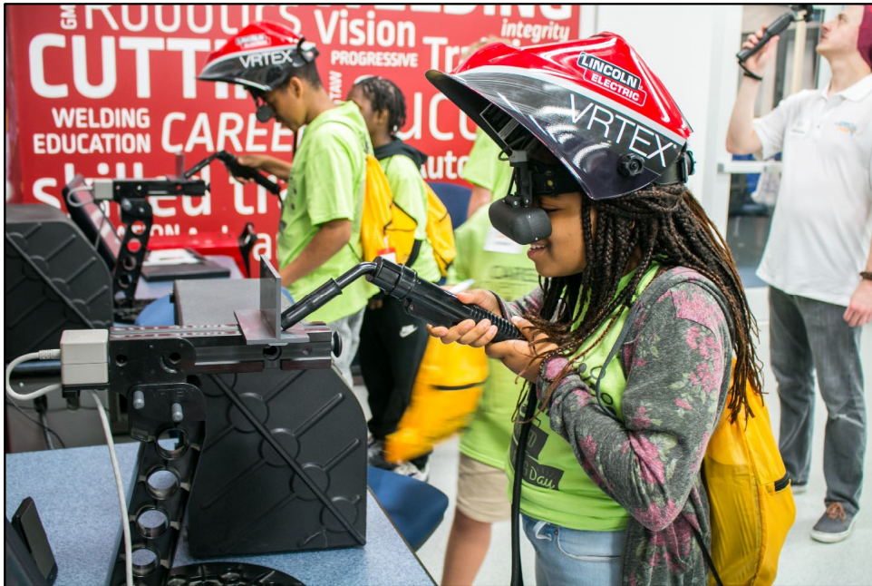
MVCTC Robotics, machining & welding lab